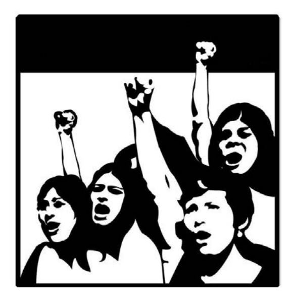
About Us: ABHIVYAKTI